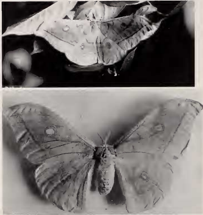
FIG. 1. Adult females of Antheraea andamana Moore.

brown bands encircling the eggs. Inner surface pale brown, smooth and highly reflective. The eggs were laid singly or in batches of 2 or 3 on the ventral surfaces of leaves. Some were laid about 1 cm apart while others were laid in contact with each other.